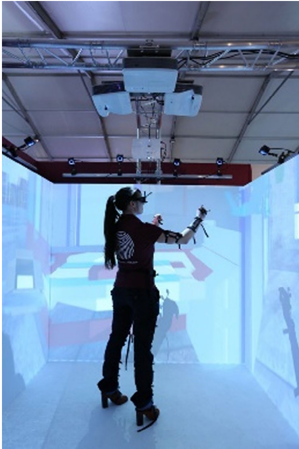
Figure 1. Neuro-psycho-motor immersion in a cave automatic virtual environment (CAVE).