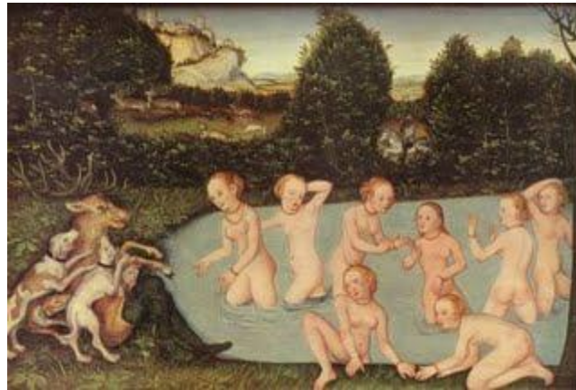
Figure 2: Lucas Cranach. Diana and Actaeon , 1540. Hartford, Wadsworth Athenaeum.