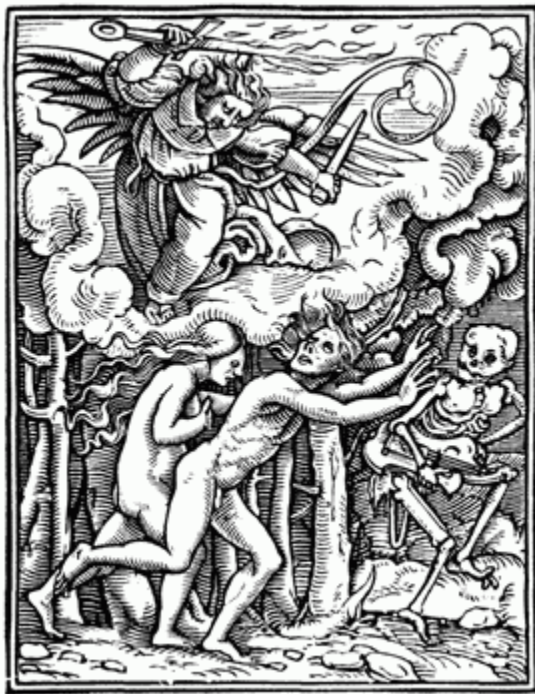
Figure 1: “The Expulsion” by Hans Holbein (1538)