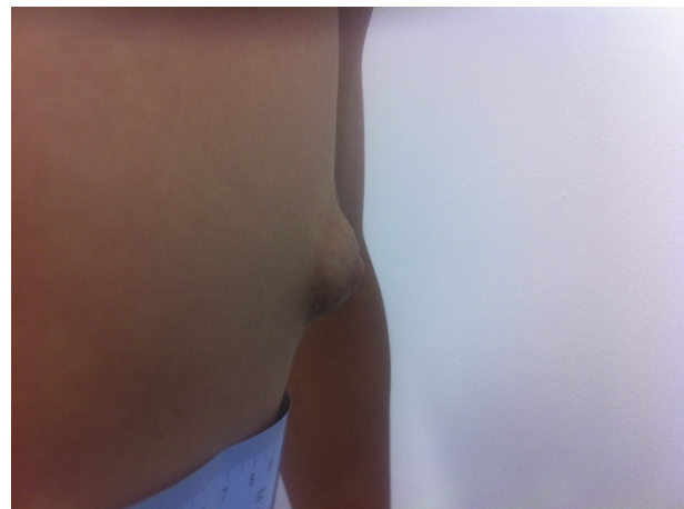
Figure 2 Side view of prominent left unilateral pubertal gynaecomastia at baseline.

periductal inflammation occur as a result. This rapid growth often occurs over the first six months of Tanner Stage 3 puberty, when pubertal gynaecomastia is most symptomatic (enlargement, pain and tenderness). While pubertal gynaecomastia is a cosmetic condition and the natural history is spontaneous regression in 90% of cases within three years [3], it is frequently psychologically distressing and causes embarrassment until it does so, with some adolescents electing to undergo potentially disfiguring surgery [4].