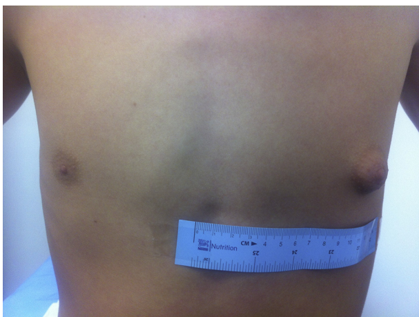
Figure 1 Prominent unilateral pubertal gynaecomastia at baseline. Left breast measures 3 cm [2].

Pubertal gynaecomastia is a benign physiological process arising from a transient imbalance between the greater stimulatory effects of oestrogens and lesser inhibitory effects of androgens on breast tissue during puberty. It is usually bilateral and affects up to 70% of adolescent males [1], with a peak incidence at approximately 14 years of age [2]. Oestrogen levels may become elevated from increased peripheral aromatase activity (often occurring in the adipose tissue of obese males and delaying puberty). This increases the SHBG levels, which bind free (active) testosterone, reducing its antitrophic action on breast tissue. Glandular proliferation, ductal hyperplasia and