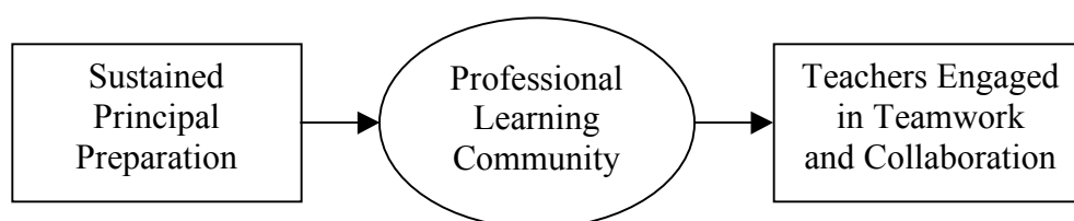
Figure 1. General Conceptual Model of Research Study

schools, in-depth research on the individual characteristics of professional learning communities is needed to add clarity and value to this growing movement. In order to understand the complex effects of sustained preparation offered by the Principals Academy on teamwork and collaboration in schools, teachers must be surveyed. Figure 1 provides a simple conceptual model of the research problem this study addresses.